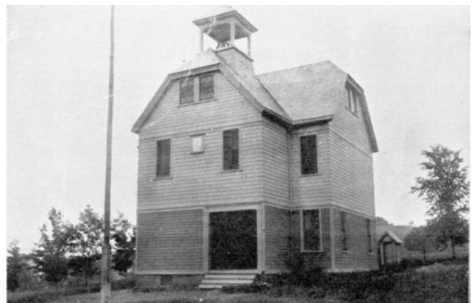
Old Delanson High School