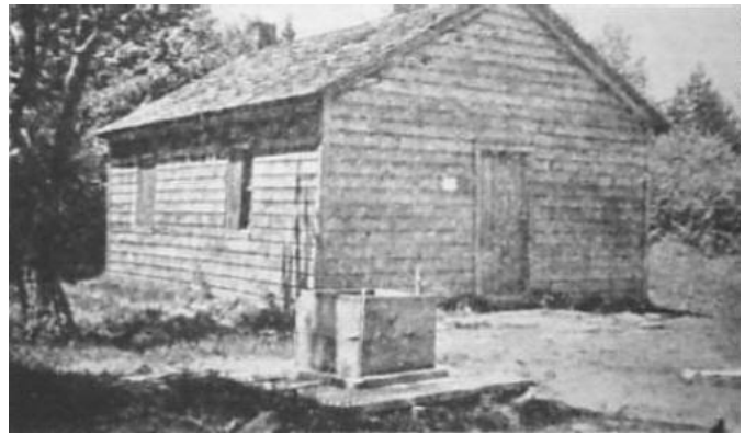
Lake School Mariaville

We look forward to you being a part of this project. Please share this information with friends, relatives or neighbors who you know have a story to tell.