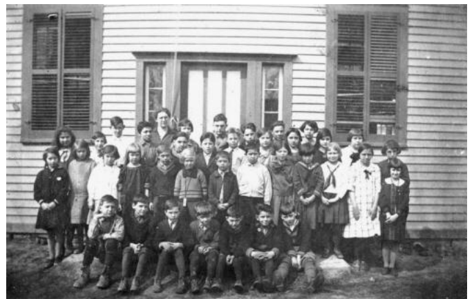
One Room School House and Class