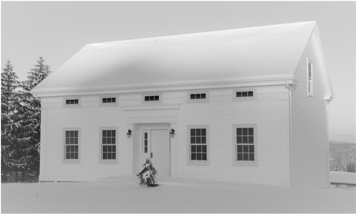
Duanesburg Historical Society Research & Archive Center