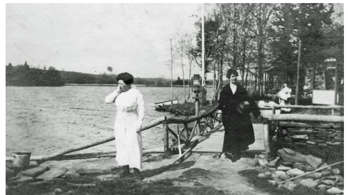
Camp life and the island at Mariaville Lake