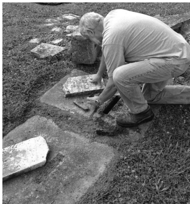
Repairing Grave Markers