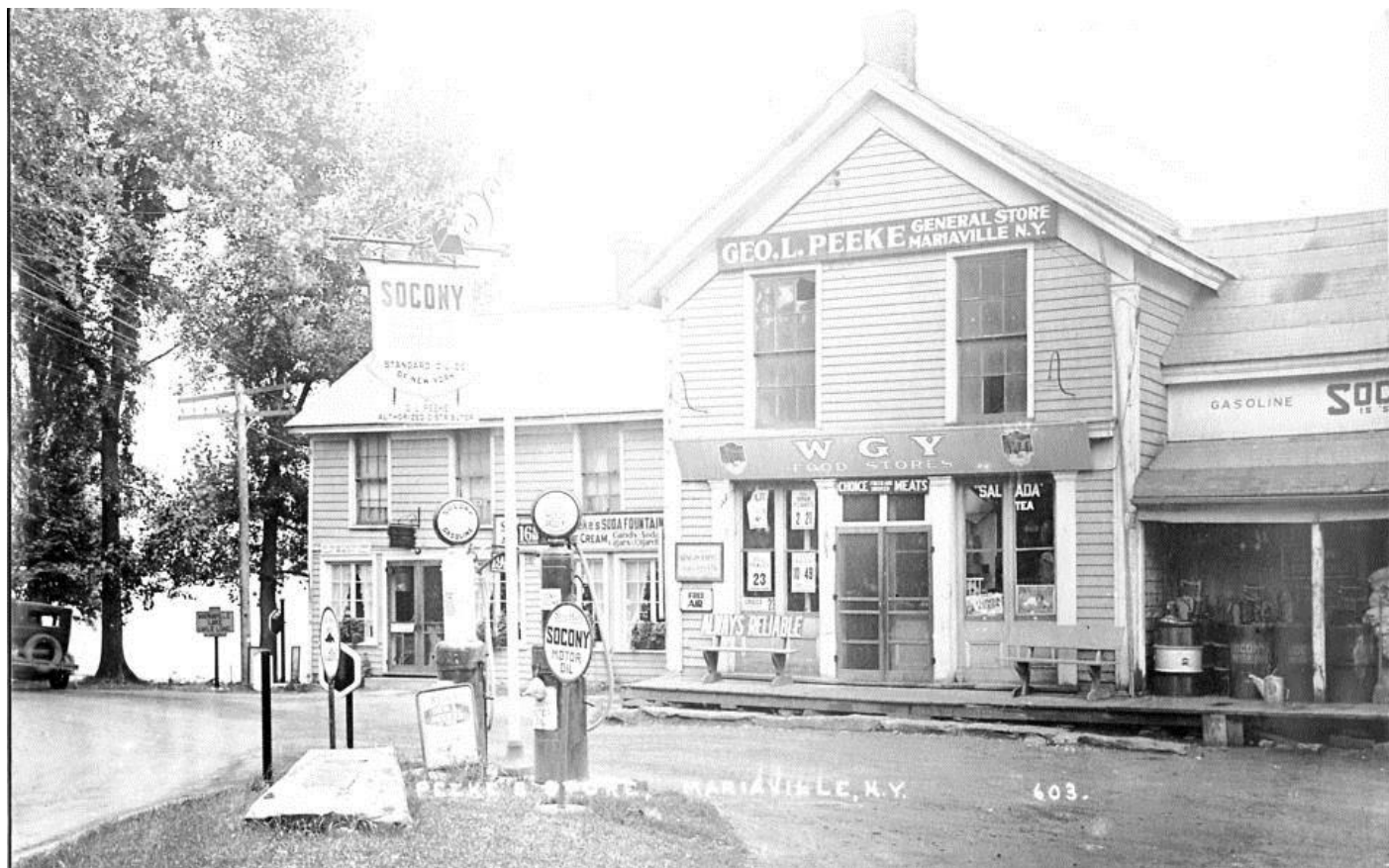
Peekes General Store – now Mariaville Lakeside Country Store