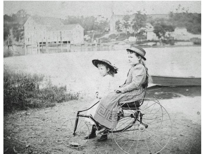
This photo may show a mill at the dam of Mariaville Lake